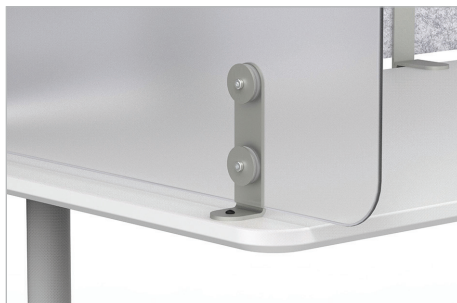
Top Direct (North America Only)