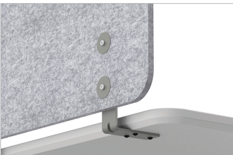
L Bracket (North America Only)